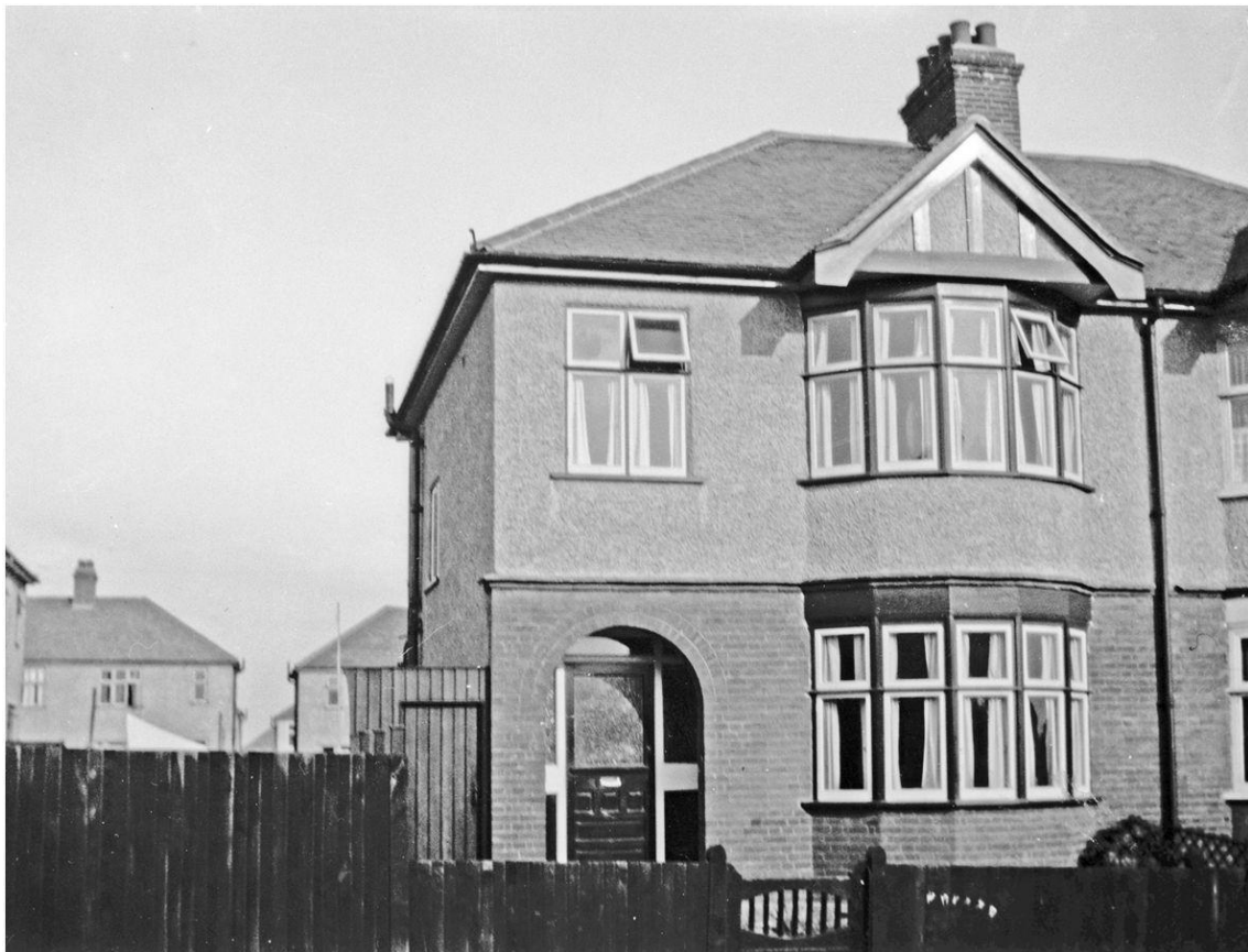
FIGURE 6.1 8 Collingwood Gardens, Wanstead, London.